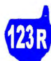
Cross Country Women & Youth Girls C Class Blue Plates / White Numbers