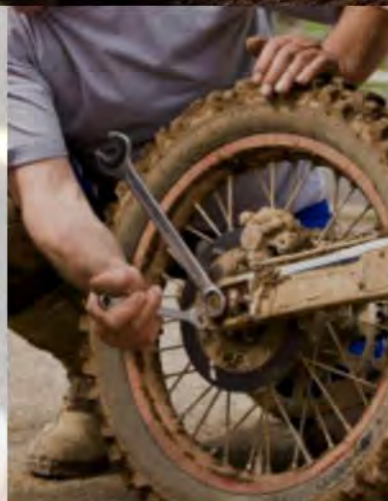
Service & Repair