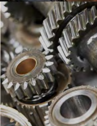
OEM Parts Finder