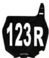
Cross Country Adult & Youth A class Black Plates / White Numbers