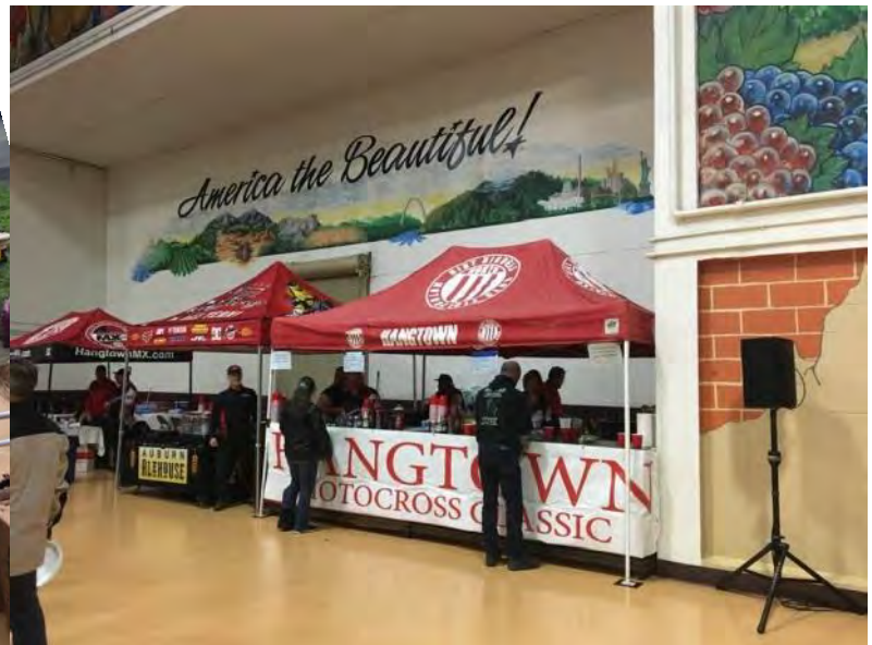
The Bar Thank you Dirt Diggers!