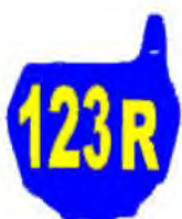
Cross Country Women & Youth Girls B Class Blue Plates / Yellow Numbers