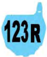
Cross Country Women & Youth Girls A Class Light Blue Plates / Black Numbers