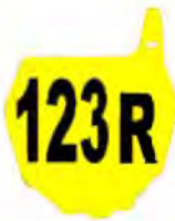
Cross Country Adult and Youth B Class Yellow Plates / Black Numbers