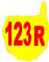
Youth AA Class Gold/Yellow Plates with Red Numbers