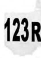
Cross Country Adult and Youth C Class White Plates / Black Numbers