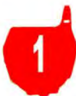
Cross Country Top 20 Overall and AA class Red Plates / White numbers