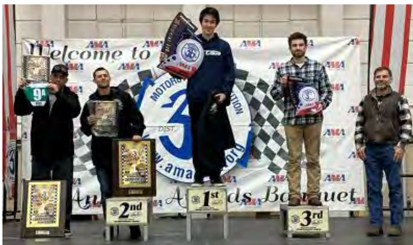
Lineup of 2022 Enduro Champions