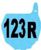
Cross Country Women & Youth Girls A Class Light Blue Plates / Black Numbers