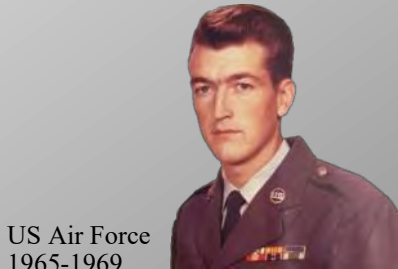
US Air Force 1965-1969