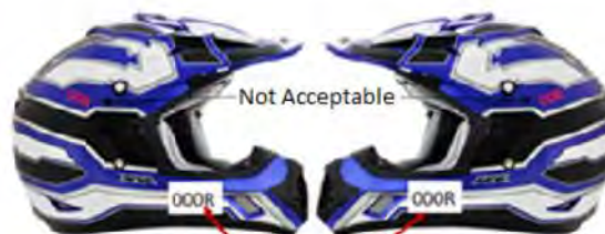
Required Helmet Stickers on Both Sides in this location