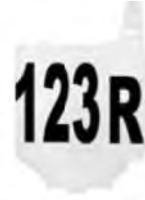
Cross Country Adult and Youth C Class White Plates / Black Numbers