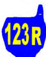
Cross Country Women & Youth Girls B Class Blue Plates / Yellow Numbers