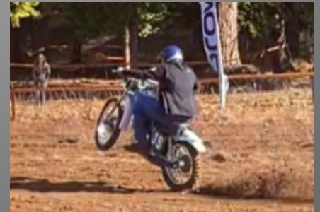
Bob's last ride November 19, 2022