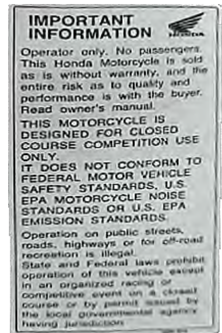
Sticker found on 2022 & Newer Competition on bikes

There are many forest, and BLM districts in California and they seem to have different takes on how "they" may enforce non-registered (competition) vehicles. Some forests are not interested in what color sticker you have, just that you have one. Does an out of state sticker legally get a California resident off the hook... no because you are a California resident. Does a green sticker from another (dead) bike get you off the hook... no because your bike has a distinct vin number that tells what year and whether it's a competition bike or not. So if you choose to recreate on public lands with a 2022 or newer competition bike, do so at your own risk. The good news (for now) is that for the most part if you recreate in a responsible manner, have a spark arrestor, helmet and a good attitude, most forest and BLM folks aren't really interested in checking your sticker, just that you have one. District 36 has gotten a temporary agreement with some Forest, and BLM districts for an "education" period for riders with competition bikes to become informed. So it's your responsibility to be informed of the consequences where you ride.