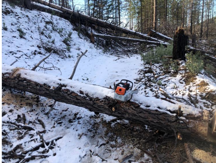
Trail Clearing at Upper Lake RD

PARTNERSHIP WITH PWORA FOR REOPENING CLOSED ROUTES - The LAO continues to work with PWORA in support of their efforts to reopen OHV routes on the Upper Lake Ranger District that were closed due to heavy winter storms that downed hundreds of trees. Thanks to many D36 riders who have been working hard on these efforts!