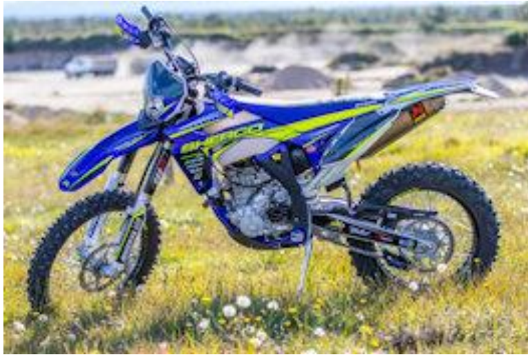
2023 Sherco 300 SE

A permit issued by the Department of Parks and Recreation, Off-Highway Motor Vehicle Division, would be a relatively simple and cost-effective alternative to the proposed COMPETITION Sticker identification and would satisfy state and federal agencies that require some type of OHV identification at sanctioned events on public lands. Watch for updates.