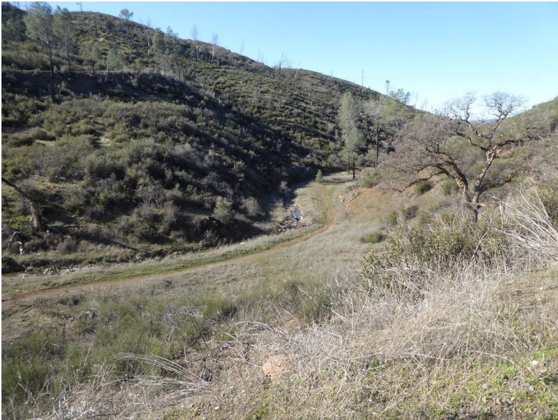
Popular Unauthorized OHV Route Near Walker Ridge

FIRESCAPE MENDOCINO - Continued to represent the interests of D36/OHV recreation at the monthly meetings of FireScope Mendocino, a major forest health collaborative in Region 5 since pre and post wildfire mitigation of OHV roads and trails remains an important focus of project work. Many of these areas are used for sanctioned events and casual use.