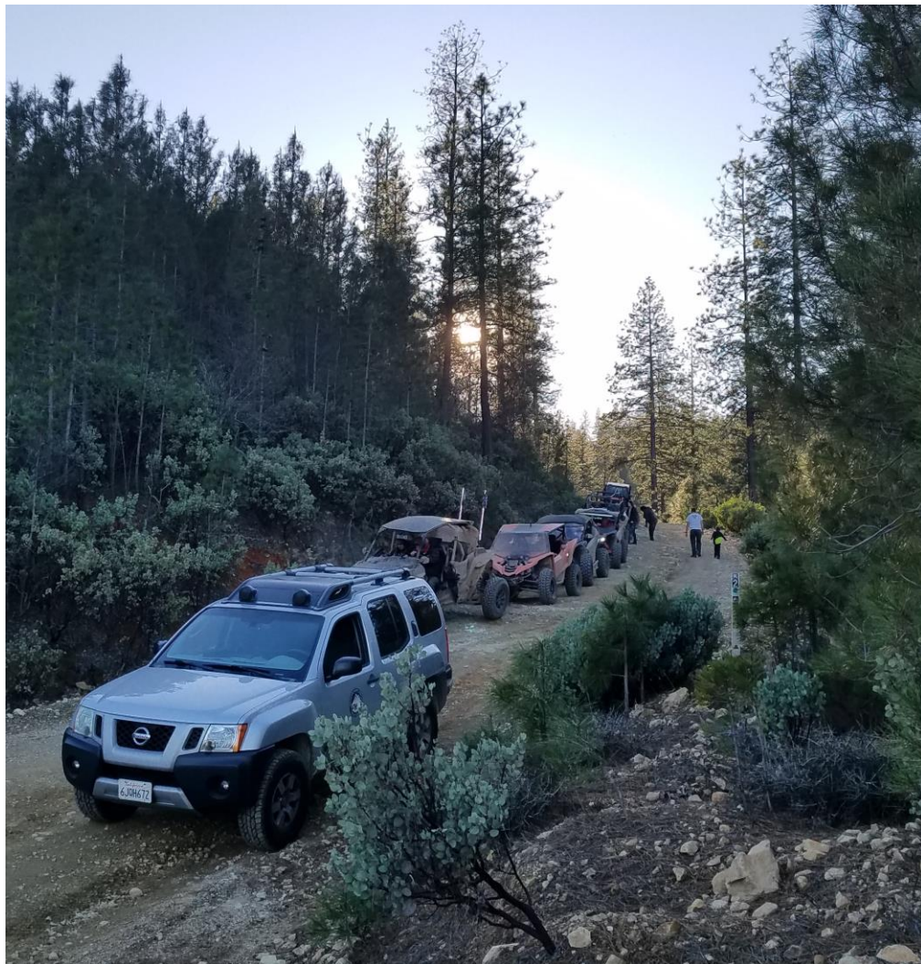
Road Block on the 2 Road Preventing Non Event Vehicles from Entering the Course

It was great to see over 150 members of the greater trail stewardship community attend the NCWR award dinner to celebrate and honor each other for a job well done. Many D36 sponsors including KTM and Motion Pro were there as well.