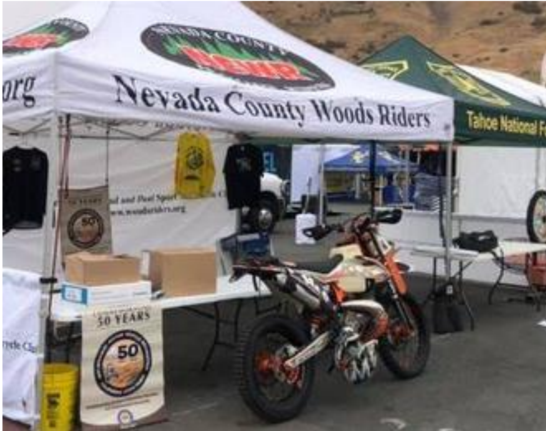
NCWR Booth at IMS Show in Sonoma