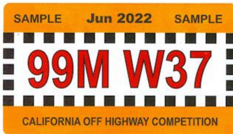
Mock Up of Competition Decal

COMPETITION STICKER (SB 227) – As you know, the environmental lobby was successful in having the Assembly Transportation Committee remove the “competition practice” component of SB 227. However, Senator Jones was successful in getting bipartisan support for registration, title, and competition sticker elements of the bill that legitimizes the off-highway vehicle competition sport and industry by providing riders with a way to register their vehicles through the Department of Motor Vehicles. Registration is necessary to receive an official DMV title and allows for a dealer to finance a new purchase, for an owner to secure insurance, and for law enforcement to track stolen or lost vehicles.