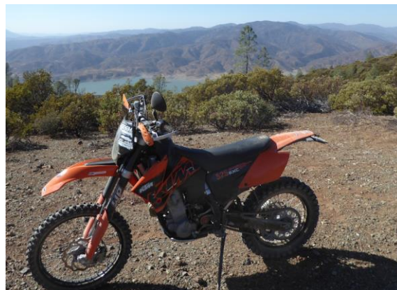
View of Indian Valley from Walker Ridge

BERRYESSA SNOW MOUNTAIN NATIONAL MONUMENT TRAVEL PLANNING – Earlier this year, many D36ers participated in several pre-scoping “listening” meetings with the Monument planning team where you offered ideas on how to improve legal riding opportunities for OHVs in popular areas such as Knoxville and Indian Valley where historic motorized use has occurred for decades.