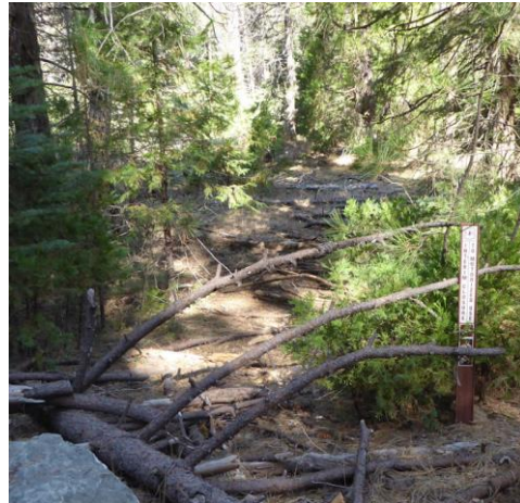
Trail that was closed in lawsuit to be reopened