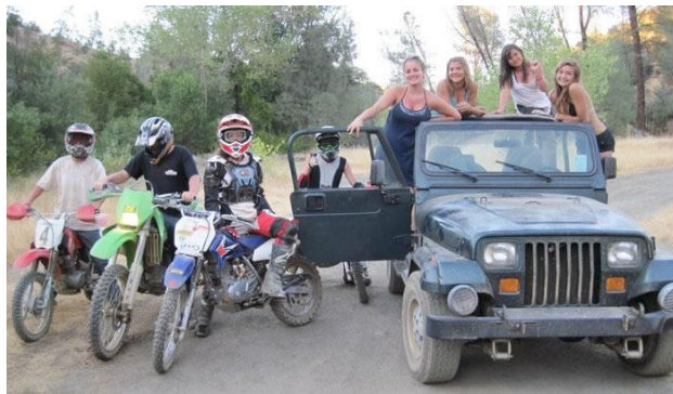
D36 LAO Tour with Wildhorse Ranch Manager and OHV Committee Member

NEW D36 EVENT VENUE – On May 10, the LAO toured the 14K acre R Ranch with the property manager and a ranch OHV subcommittee member for the potential of it hosting a D36 competition event(s). This property is zoned for and managed as a recreation facility for both motorized and non-motorized uses. It has a vast network of existing roads and trails and a 900 acre OPEN area where new routes can be created. It also has great staging areas for dry camping with RVs and cabins for rent. It has a lodge and a recreation center with swimming pools where event dinners and meetings can be held. Families who want to ride here during non-event times can purchase a partial deed that allows them year around access.