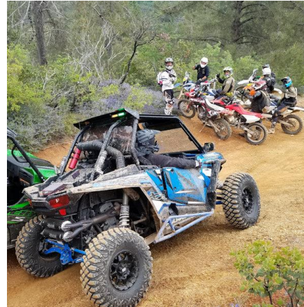
Agency Staff take Dirt Bike School class -- SxSs and Dirt Bike meet at trail intersection