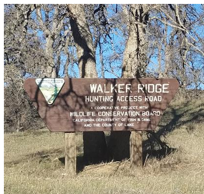
South Entrance to Walker Ridge

https://ohv.parks.ca.gov/pages/1140/files/Permit%20Mail%20Order%20Form%202022-2023.pdf