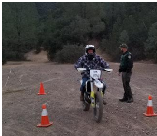
FS LE at Tech Station for 2022 Jackhammer

Those OHV protections will be extended to the Walker Ridge area when it is added to the existing Monument. Having the additional land protected from energy development will also help the LAO and others finish the Monument OHV Travel Plan that has been put on hold until the energy issue is settled.