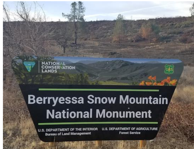
BLM Knoxville OHV Area

EDUCATION OF NEW LEGISLATORS in 2023 – Again, there will be an historic number of new legislators coming to Sacramento after the fall election. This massive sea change is due to a large number of current legislators being termed out. The LAO Program has asked the OHV Division to partner with us in a joint effort to educate (both in-person and in the field) new legislators and their staff about the OHV program and its many positive and pro-active tenets including conservation, restoration, LE, and safety. Field trips for legislators/staff to local SVRAs such as Prairie City SVRA have proven highly effective in helping them understand and appreciate the value of our program.